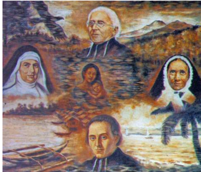
Four Marist Founders with Mary & Child-Jesus